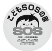
Kodomo SOS Home Sticker

Tell your child in advance that they can ask for help from neighborhood stores, homes, and convenience stores with a "Kodomo SOS" sticker, in addition to police boxes.