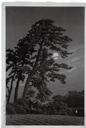
“Moon at Magome” Twenty Scenes of Tokyo 1930

This special exhibit, which will be divided into two sections, will present works from Hasui’s entire career – from his start as an artist until his later years – as well as his sketchbooks, diaries, favorite items, and photographs. The first section will mainly feature scenes of Tokyo, Hasui’s birthplace and a place of special emotional attachment for him. The second section will present scenes of the places that Hasui visited as an enthusiastic traveler.