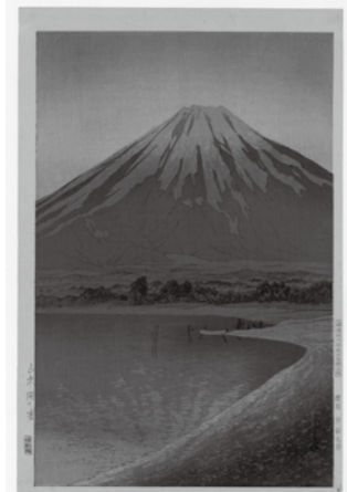
“Dawn at Lake Yamanaka” August 1931

We invite you to come and appreciate beautiful scenes of Japan as captured by Hasui Kawase.