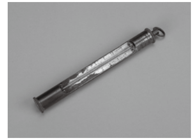
A thermometer belonging to Kaishu that was once displayed at the Seimei Bunko Library

The Katsu Kaishu Memorial Museum is housed in the former Seimei Bunko Library, a nationally registered tangible cultural property. In the early Showa period (1926-1989), the library preserved artifacts and collected books associated with Kaishu. This exhibit focuses on a "Tenrankai" (exhibition) project the library held then and presents items that were shown there.